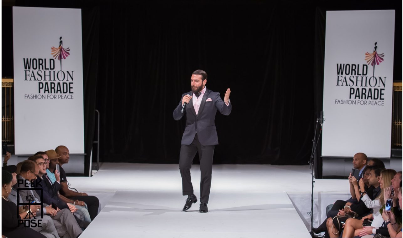
Watch Amine J. Hachem perform live Abballati Abballati in New York Fashion Week