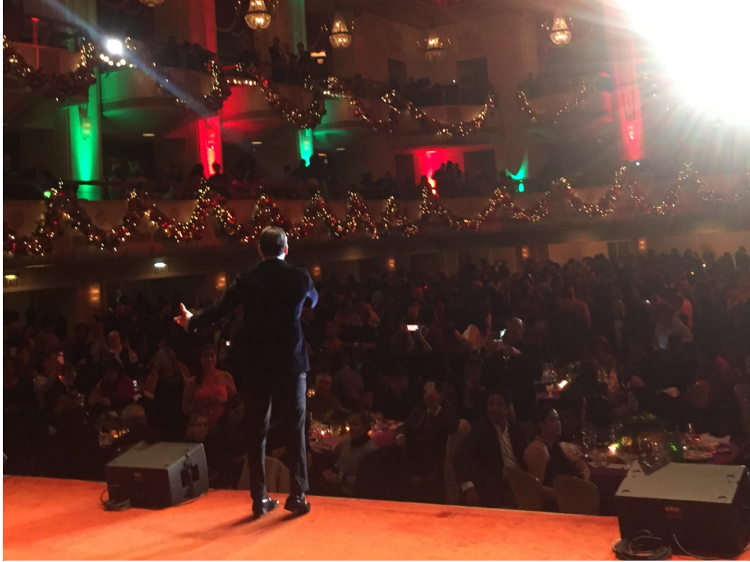
"Captivating!" iHeart Radio