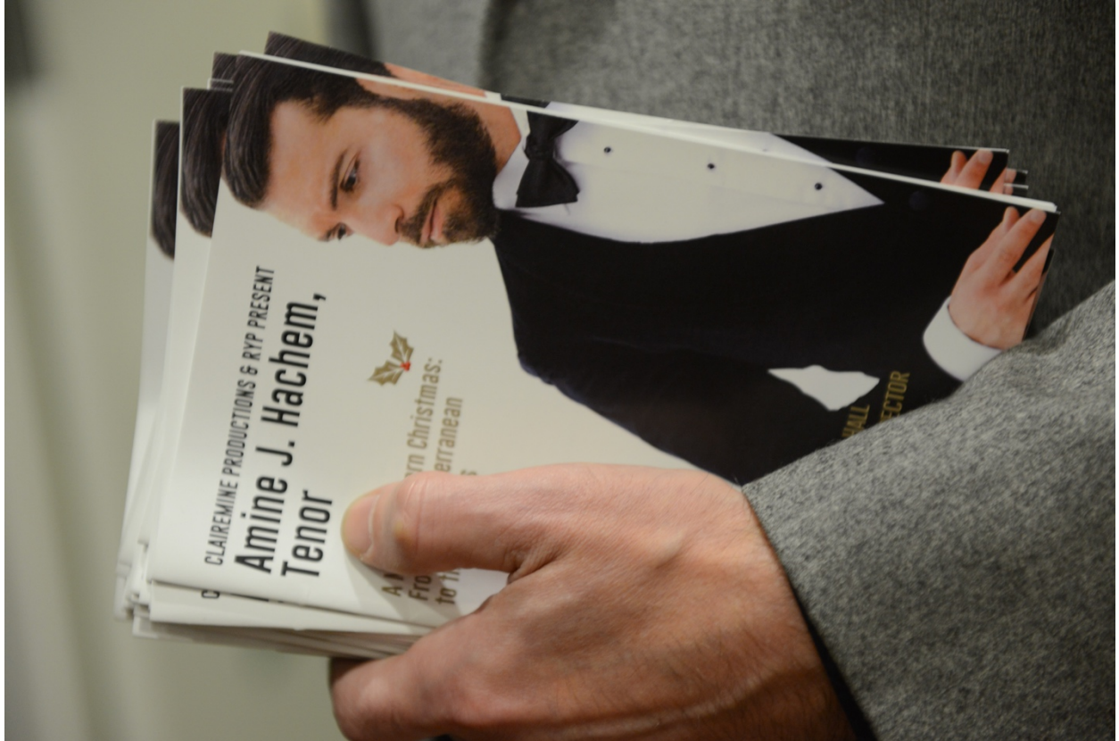
"...audiences ate from his hand!" – PBS