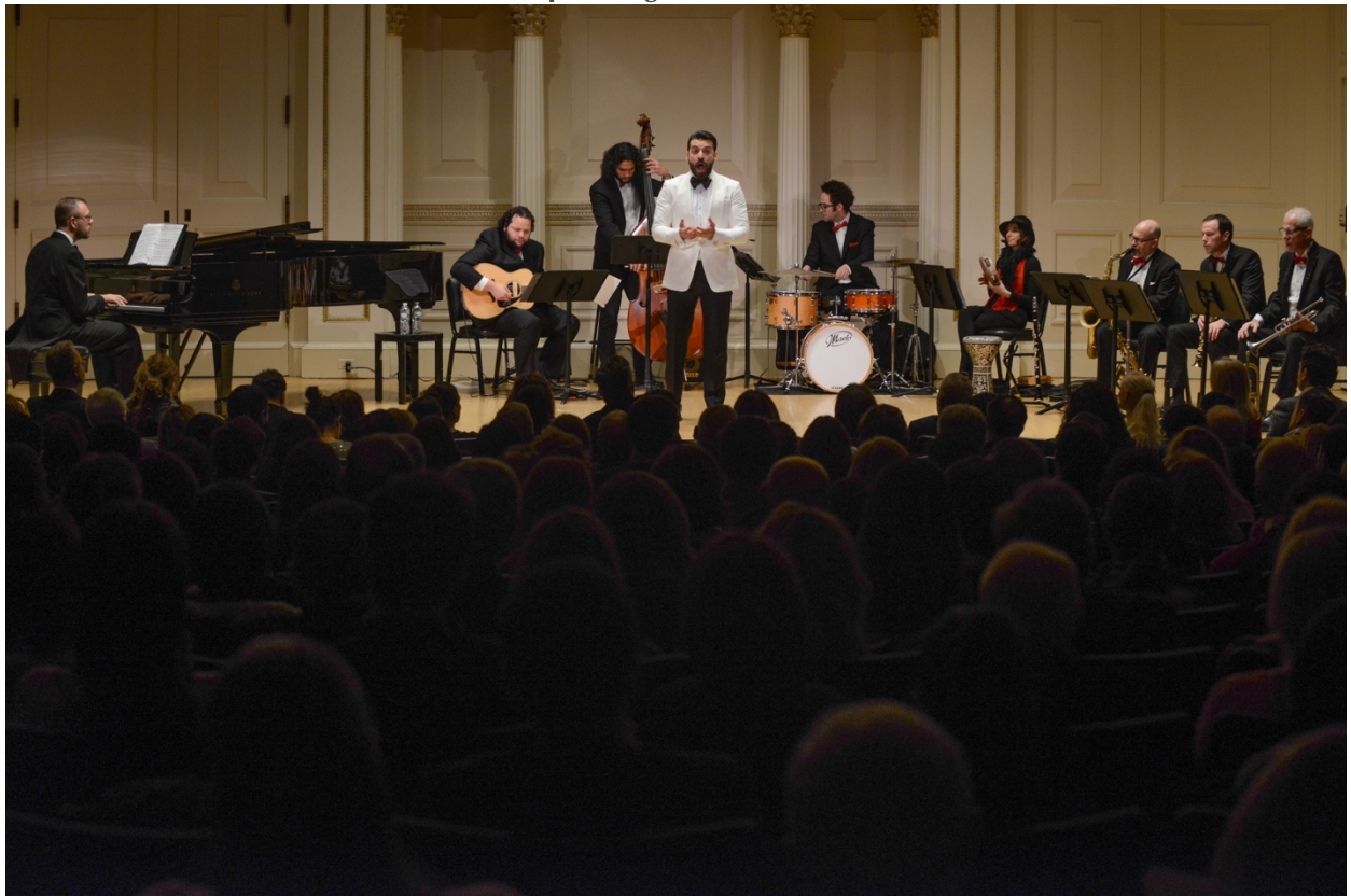
"One of the best holiday concerts in NYC" – Metro New York